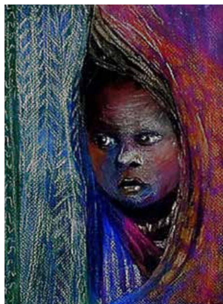
Title: Diva Date: Unknown Medium: Pastel Size: 13" x 17.5"