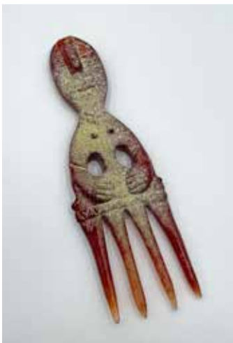
Title: Comb Artifact

As he continues his glass journey 15 years later, he's still always ready to learn from other artists, along with sharing what he's learned along the way.