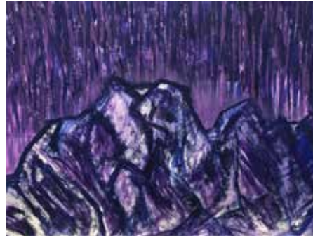
Title: Purple Hues

Love Yourself was my first commissioned public art piece by the Tacoma Art Commission and City of Tacoma. I have curated several shows, taught Art in Ghana, and done art workshops in Pierce County.