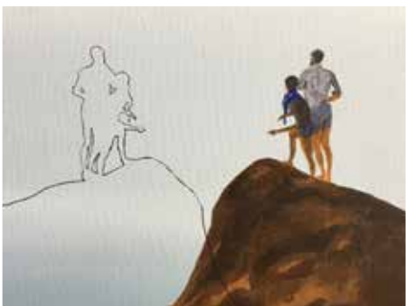
Title: The Impossibility of Knowing (10): Seekers