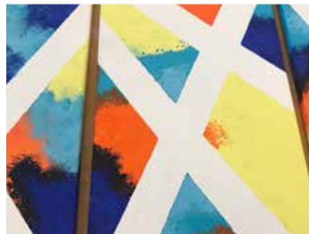
Title: Abstract Series 1

Purple Hues was inspired by an abstract drawing I completed over a period of days during NOC shift working as a Recovery Specialist at an Outpatient Behavioral Health Facility. I explored different brush strokes, varied application, and multiply layers. Before I added the mountains, the piece resembled something like purple rain.