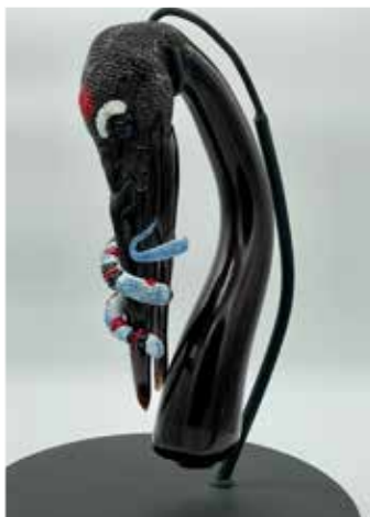
Title: Hungry Heron

to trade with. Still digging up these ancient pieces today, this comb shows the old tribal designs, along with years of wear.