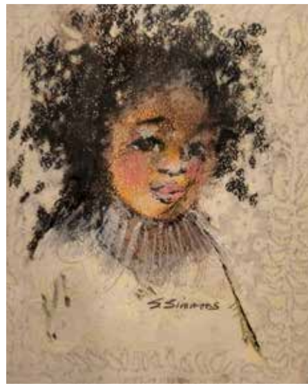
Title: Curls Date: Unknown Medium: Pastel Size: 7.5" x 9"